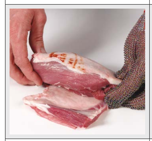
13. Roll the silverside muscles so that the lean surface is covered by an external fat layer...