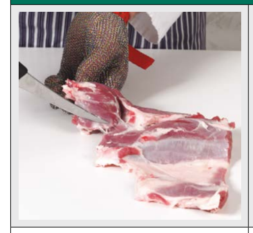
9. Remove the remaining knuckle muscles from the silverside.