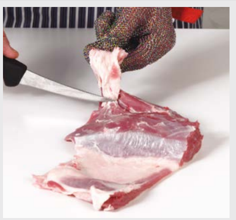
10. Remove fat deposits...