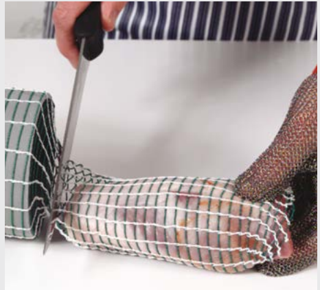
14. and secure in shape with elasticated netting.