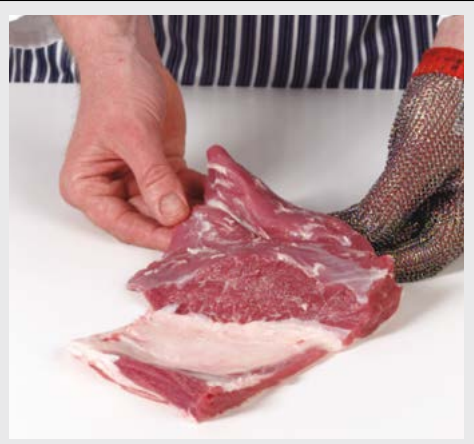
12. Silverside trimmed to specification.