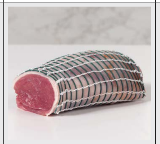
15. Prepared noisette joint.