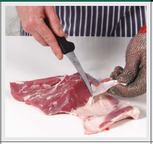
11. and connective tissue to expose the lean surface.